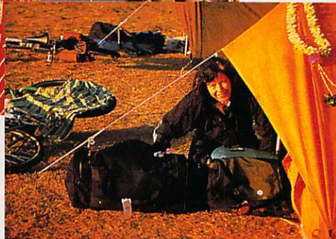
So sari... Top, a pit stop at the Hemavati River; center, scene from a wedding, happened upon en route; above, camp at Mercara, in the Western Ghats.