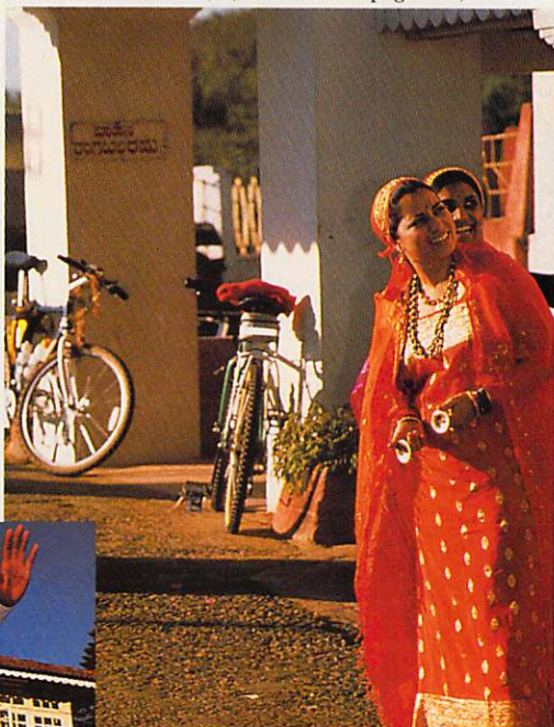
Along the way, the group curried favor with locals, including two Coorgi women, right, and a stick dancer, below. Below, right, assembling the bikes.

"I . . . I don't know." In the lounge at Heathrow, our group huddled around a copy of The Hindustan Times . India, we learned, had the (continued on page 162)